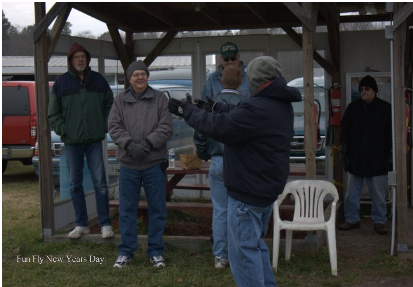
Fun Fly New Years Day