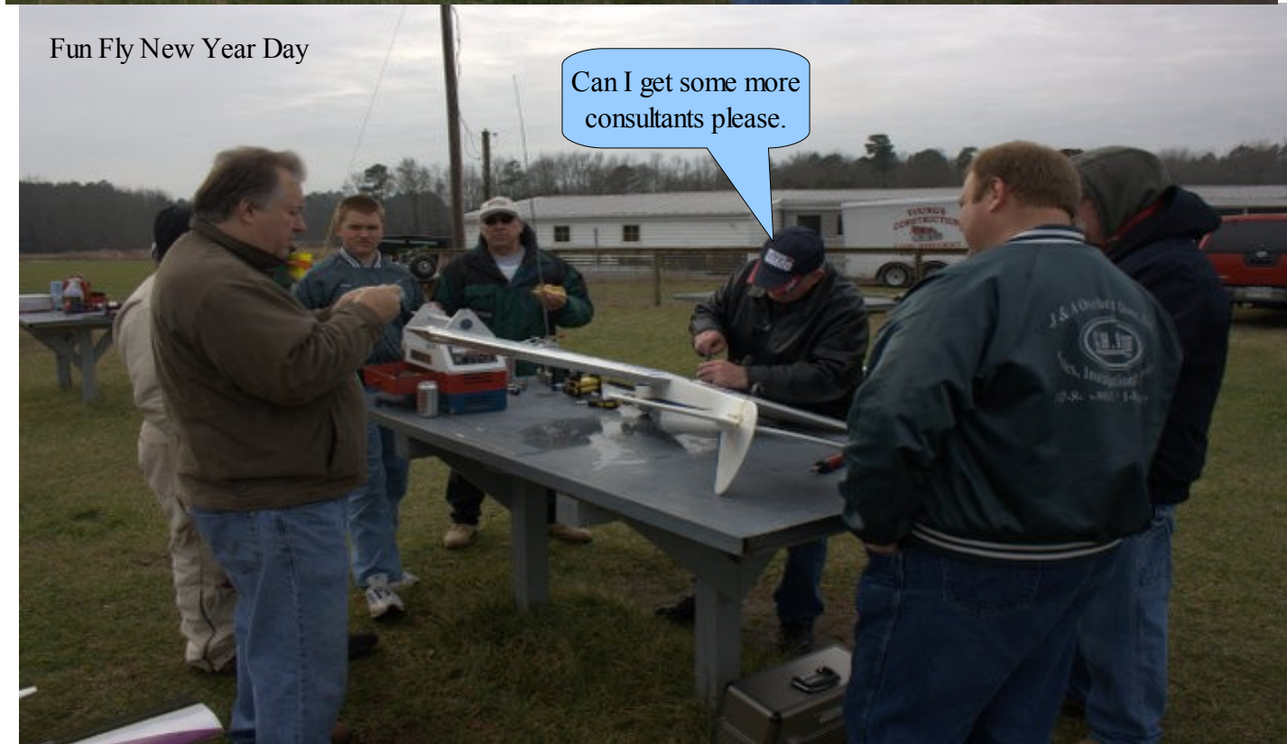
Fun Fly New Year Day